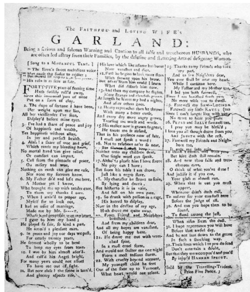
Weston-History of Middleboro-broadside

Hannah's broadside is listed in a compendium published in 1922, Broadsides, ballads, &c. printed in Massachusetts, 1639-1800 by Worthington Chauncey Ford (1922). The author cites the original as being located at the Massachusetts Historical Society. The broadside developed in sixteenth century England as a way to publicize royal proclamations, acts of Parliament, and notifications from local officials. Its use spread to personal topics because of its low cost and ease of distribution. In Massachusetts broadsides were adopted to address political issues, announce births, deaths, and executions, and for governmental purposes. In addition, ballads evolved in this format for personal use. Hannah's broadside states it is to be "Sold by the Travelling-Traders. ( Price Five Pence.)" Broadsides virtually disappeared by the early 1800s, replaced by the newspaper. But the role that broadsides played in our ancestors' lives continues to be realized in today's pervasive social media!