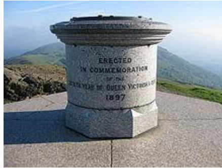
File photo of Worcestershire Beacon

The Malvern Hills, managed by the Malvern Hills Trust, are a range of hills along the Worcestershire Herefordshire border, with a small area touching northern Gloucestershire.