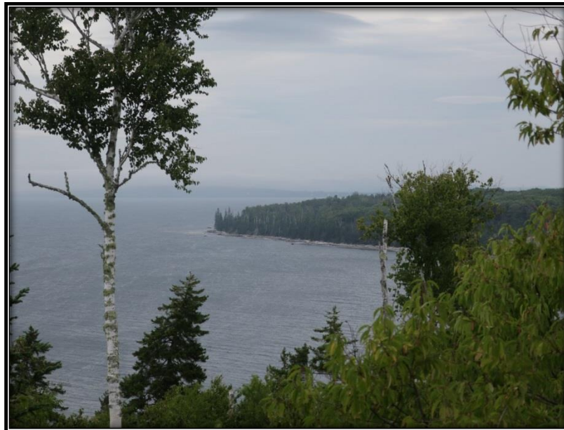
View of Penobscot Bay from Lookout