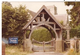
Distinctive gate leading to St. Peter’s Church