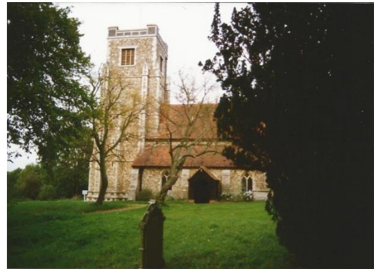
Parish Church, Hempstead Heath, Essex England