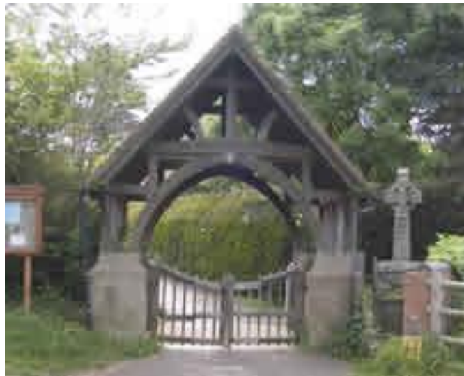
A distinctive gate greets visitors and worshipers at St. Peter’s Church

There is another historical fact that may have also influenced Edward, Sr., to portray himself as a loyal member of the Church of England. “But upon this church-going, salt-victualling Edward, Sr., of unblemished Anglicanism, there fell what we may regard—in the state of religious opinion in the England of that time—a heavy blow. The key to this is among the Talbot MSS., a certificate by the Bailiffs of Droitwich, Borough seal attached, a document acquired by the British Museum as recently as in 1937. It concerns the salt-vats as used in 1602-05; it recites that twenty-five of the boileries had been held by Robert Wintour, Esq. , late attainted of high treason; that ‘Edward Wynslowe’ had been among the tenants.....and that one boiler, until the third year of James I in the tenure of Edward Wynslowe or his sub-tenants, had been sold by the said Wyntour to one Thomas Gower, gent. Here we have Edward Winslow, Sr., in the fall of 1605, a tenant, sub-tenant, occupier, entre-preneur or what-not, a circumjovial satellite to one of the more prominent conspirators against Protestant king and parliament. Winter bowed to the Tower executioner January 30, 1605/6, for his share in Gunpowder Plot, and we may assume the elder Winslow was in a sufficiently distracted frame of mind to lean the more heavily on his church connection. (emphasis by editor) 4