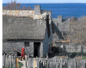
ENGLISH VILLAGE, PLIMOTH PLANTATION