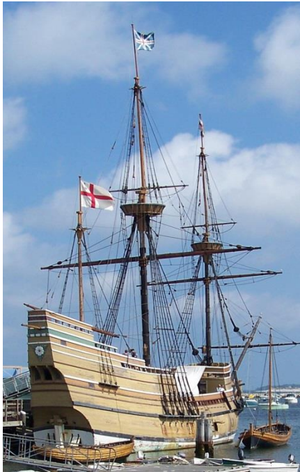
Mayflower II docked in Plymouth Harbor

In 1620 a small band of passengers bound from England to Virginia disembarked from the Mayflower onto the shore of what was to become Plymouth, MA. Known today as “America’s Hometown”, it was this year’s location for the General Society of Mayflower Descendant’s 40 th Congress. The Congress is held every three years.