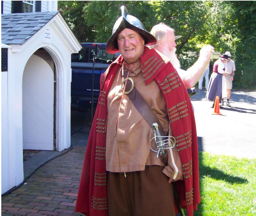
All dressed up for Pilgrim's Progress, a march from the Mayflower House to Church of the Pilgrimage for the opening of the GSMD Congress.