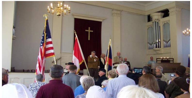
Presenting the colors, GSMD Congress