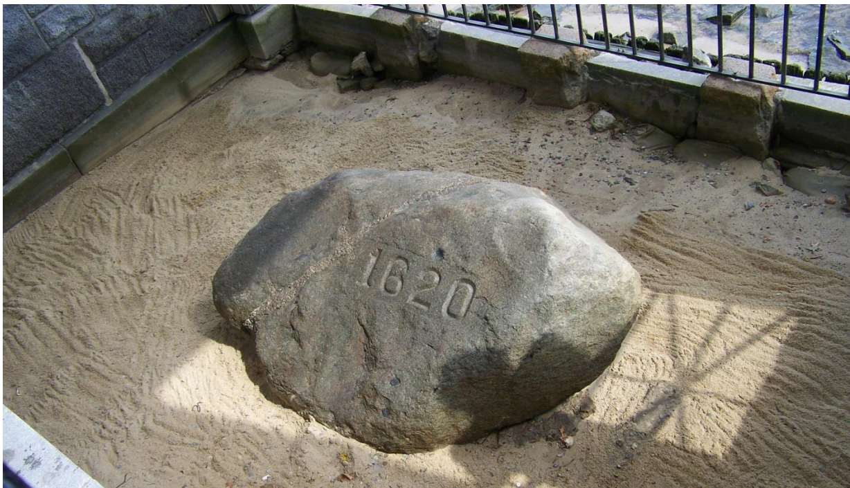
Plymouth Rock