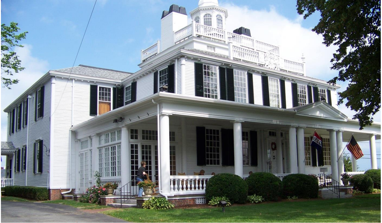
Mayflower Society House, built by Edward Winslow, direct descendant of Pilgrim Edward Winslow