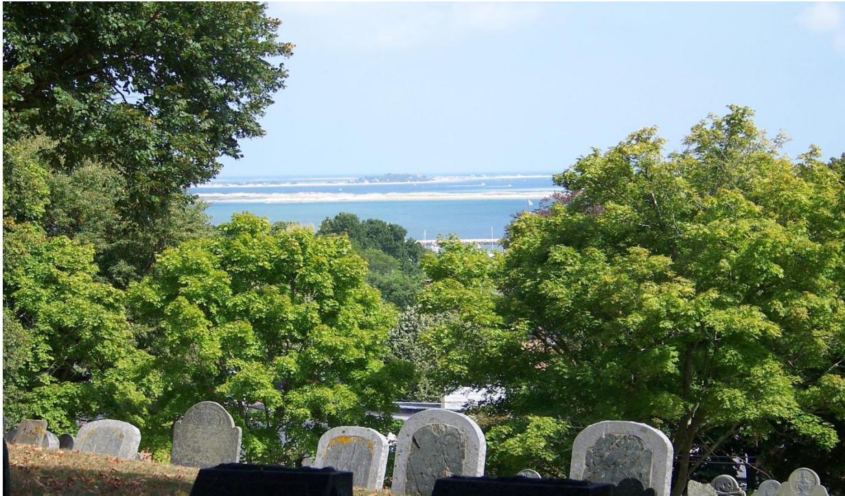
The view from Burial Hill