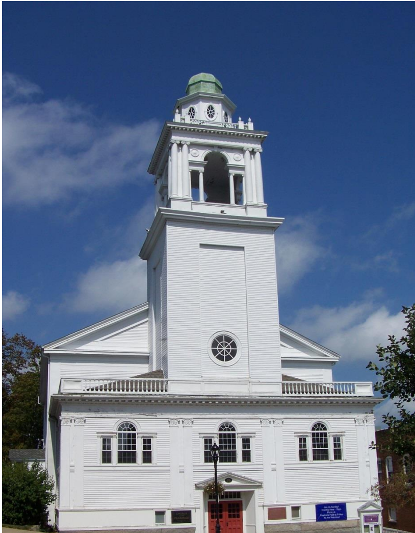
The opening service of the GSMD Congress was held at Church of the Pilgrimage, dedicated Nov. 24, 1840, very near the site of the Pilgrims' First Meeting House.